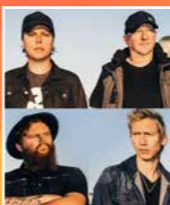
THE VIPER CREEK BAND