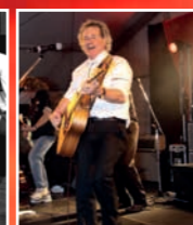
RUSTY AND THE AYERS ROCKETTES