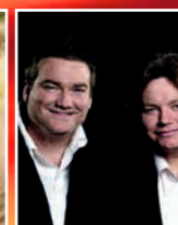
THE TOOMBS BROTHERS