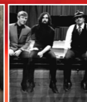
STOMPING IVORIES - THE DUELLING PIANO SHOW