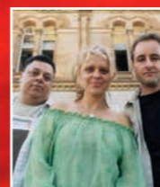
THE FERAL SWING KATZ