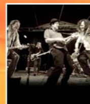
ROUND MOUNTAIN GIRLS